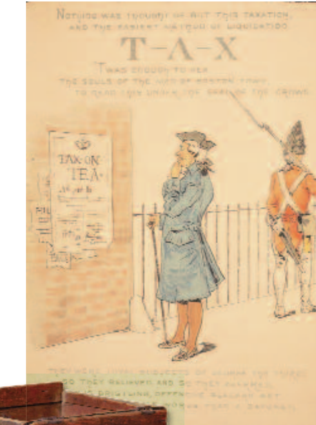
In a cartoon from the 1880s, a colonist studies a royal tax decree. The half chest (left) is one of two surviving tea crates from the actual tea party.

In the Tea Act of 1773, Parliament left the American import duties in place but decreed that the East India Company would no longer have to pay any duties on tea landing in Britain and headed to America, nor would it have to sell the tea at British public auctions. It could deliver its product straight to American consumers, untouched by middlemen and almost untaxed, save for a modest American import duty. The only people who stood