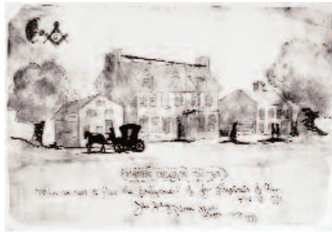
John Johnson's 1773 watercolor of the tavern where the original tea partiers reputedly met includes the Masonic compass and square. Some believe the Masons orchestrated the events of December 16.

It was not the destruction of tea that pulled Americans together; but the punishments administered several months later through a series of laws dubbed the Coercive Acts (also called the Intolerable Acts by the Americans). Parliament closed the port of Boston and revoked the Massachusetts charter, denying citizens the rights they had enjoyed for a century and a half. The goal of the Coercive Acts was to isolate radicals in